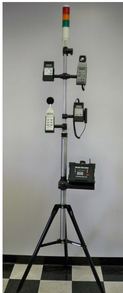
GB-2000 Shown with optional tripod stand & alarm light