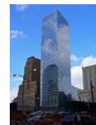
Green Building Certification